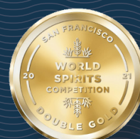
Double Gold, 2021 San Francisco Spirits Competition