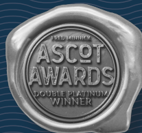
Double Platinum, ASCOT

Our Straight Rye has won a number of coveted awards and accolades that show our innovation is producing exceptional spirits. These include, but certainly aren't limited to: