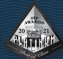
Platinum, 2021 Sip Awards